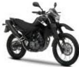
XT660R – Yamaha Black (YB)