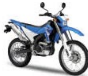
WR250R – Racing Blue (DPBSE)