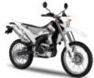
WR250R – Sports White (PWS1)