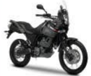
XT660Z Ténéré – Midnight Black (SMX)