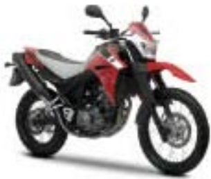
XT660R – Sunset Red (VYR1)