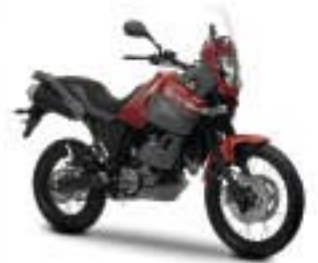
XT660Z Ténéré – Mystique Red (DRMU)