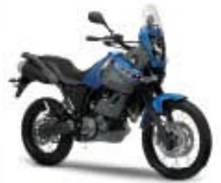
XT660Z Ténéré – Power Blue (BMC)